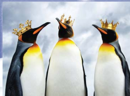
15. THREE KINGS