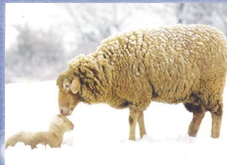
11. CHRISTMAS KISS