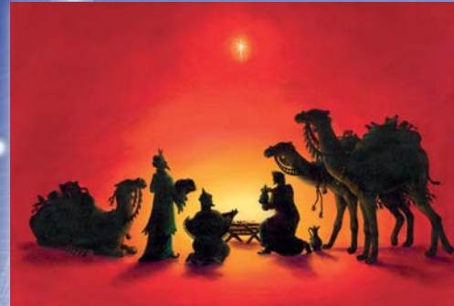
8. RED SKY AT NIGHT