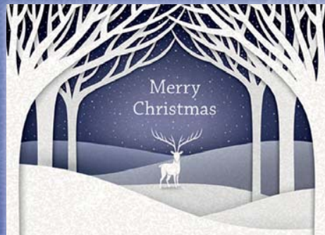
10. WINTER'S NIGHT