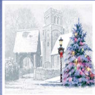
7. CHRISTMAS TREE