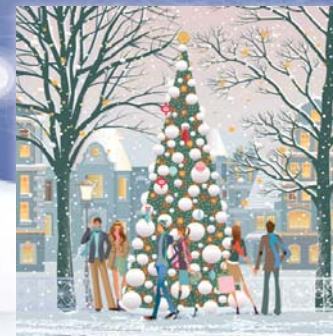
16. CHRISTMAS CITY SCENE (WITH SILVER FOIL)