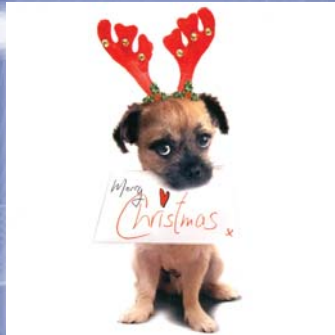
6. CHRISTMAS MESSAGE