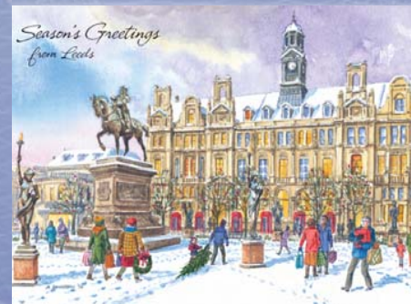
12. CITY SQUARE LEEDS