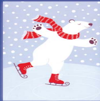
3. OUT ON THE ICE