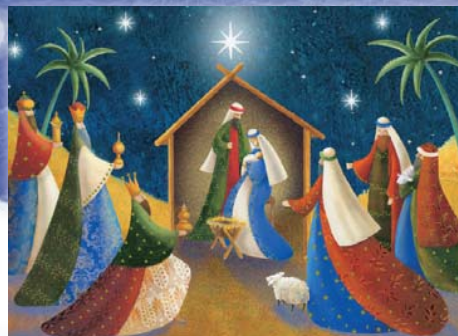
14. NATIVITY (WITH GOLD FOIL)