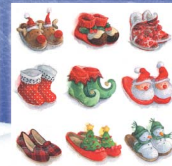
17. CHRISTMAS SLIPPERS (WITH FLITTER)