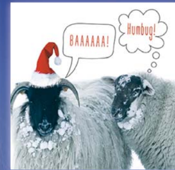
5. BAAAA HUMBUG