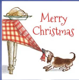
2. DOG'S DINNER