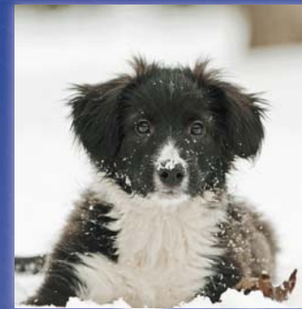
4. SNOWY COLLIE