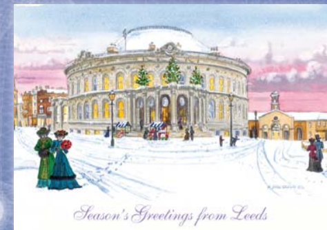
13. CORN EXCHANGE LEEDS