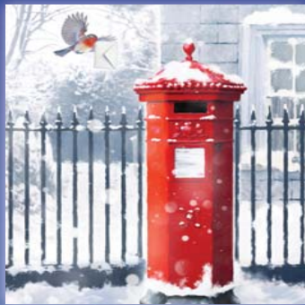
1. CHRISTMAS POST